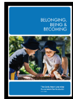
The Early Years Learning Framework 2022 V2 (Belonging, Being & Becoming)