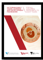
Victorian Early Years Learning and Development Framework

Approved learning framework: a guide which provides a vision for learning, pedagogical principles, practices and general goals or outcomes for children’s learning and how they might be attained. It provides a scaffold to assist educators to develop their own, more detailed curriculum relevant to their setting and the children and families attending. The Early Years Learning Framework V2 (Belonging, Being & Becoming) , the Victorian Early Years Learning and Development Framework and My Time, Our Place V2; Framework for School Age Care in Australia are approved learning frameworks for use in Victoria ( refer to Sources ).